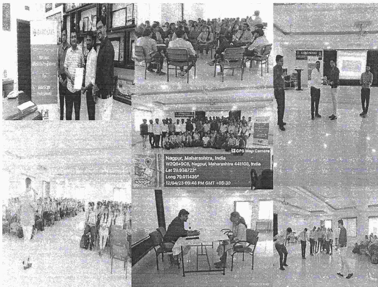
Photo: The Trainers, The Principal and Participated students for the program